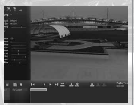
Then add a block to your track.

After you have created your clip and added a trigger to your track, create a track with a special color effect.